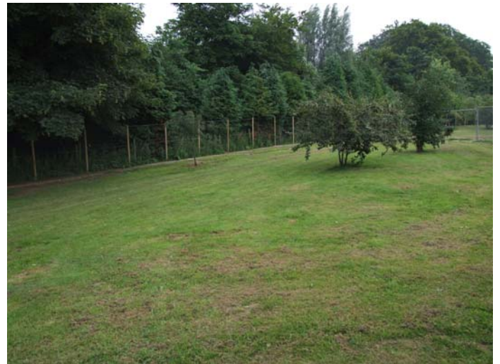
Part of the grassy area within the farm

Both blocks open out onto a large open grassy run which has plenty of smells, trees to sniff and pee on and plenty room to do a few laps at full speed before coming for a cuddle! All the dogs settle into the routine pretty quickly and are the first to let you know if you're not running to schedule! Exercised, cleaned and breakfast at 8.30am, lunchtime exercise in the runs usually involves 3 -4 laps of the run, cuddles, then biscuits at 1pm, followed by exercise, tea and bedtime at 5pm.